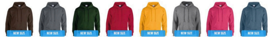
Dark Chocolate* NEW SIZE, Dark Heather* NEW SIZE, Forest Green* NEW SIZE, Garnet* NEW SIZE, Gold* NEW SIZE, Graphite Heather* NEW SIZE, Heliconia* NEW SIZE, Indigo Blue* NEW SIZE