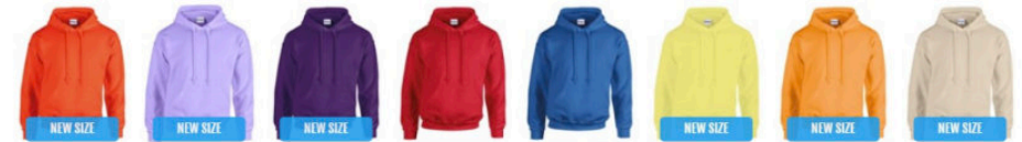
Orange* NEW SIZE, Orchid* NEW SIZE, Purple* NEW SIZE, Red*†, Royal*†, Safety Green* NEW SIZE, Safety Orange* NEW SIZE, Sand* NEW SIZE