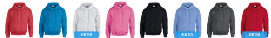
Antique Cherry Red, Antique Sapphire, Ash* NEW SIZE, Azalea, Black*, Carolina Blue* NEW SIZE, Charcoal*, Cherry Red* NEW SIZE

Machine wash warm. Inside out, with like colours. Do not bleach. Tumble dry medium. Do not iron if decorated Do not dry clean.