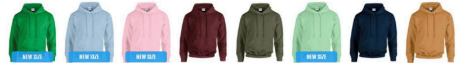
Irish Green* NEW SIZE, Light Blue* NEW SIZE, Light Pink* NEW SIZE, Maroon*†, Military Green*† NEW SIZE, Mint Green* NEW SIZE, Navy*†, Old Gold