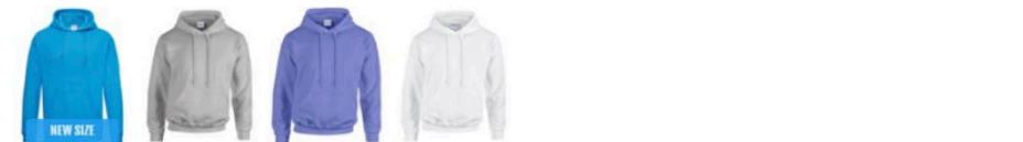
Sapphire* NEW SIZE, Soort Grev*†, Violet, White*

Also Available in Ladies Fit & Kids Sizes